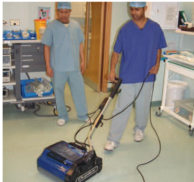
Combine cleaning with infection control