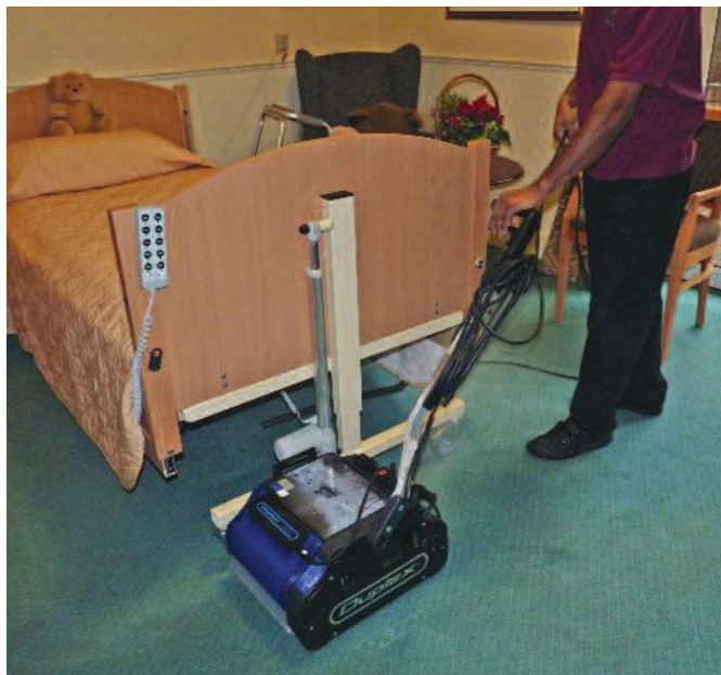
Penetrate deep into stubborn stains