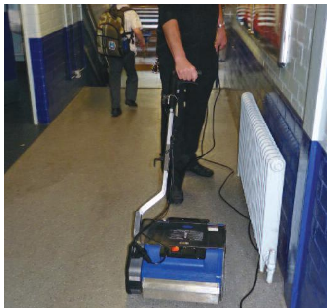
Floors are dry in minutes