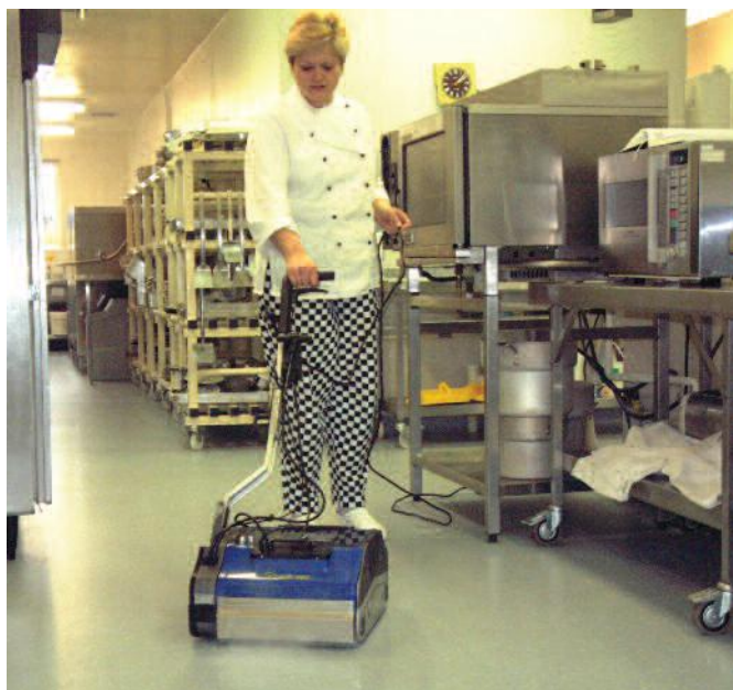
Leave floors grease free