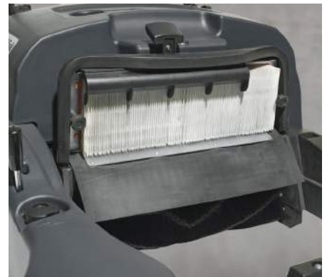
Thanks to the polyester filter the SW 750 can be used in both dry and humid areas.