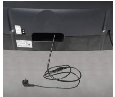
The plug-in onboard battery charger ensures continuous and hassle-free operation.