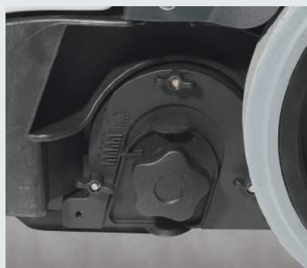
The main and side brushes are adjustable to ensure perfect pressure on the floor at all times and in all conditions.