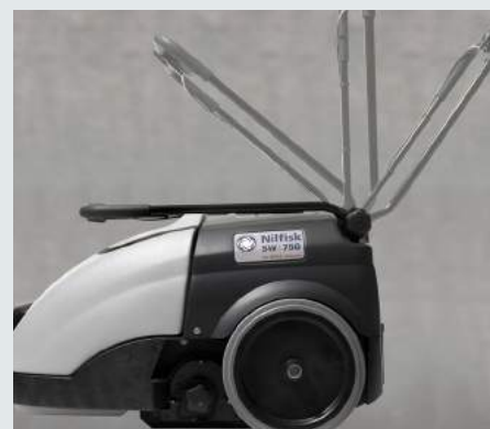
The handle is fully adjustable to suit each individual operator. It folds down completely to simplify storage.