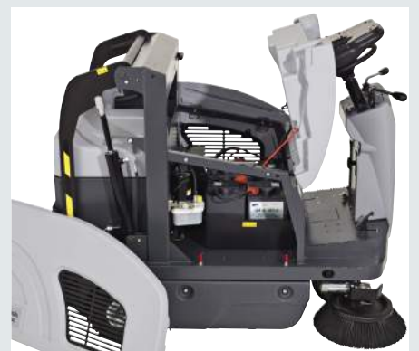
Maintenance is easy since no tools are needed for broom and filter removal and easy access to all components makes maintenance and service fast and easy