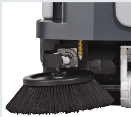
DustGuard™ misting system adds to the dust free sweeping improving the environment for operator as well as the surroundings (optional)