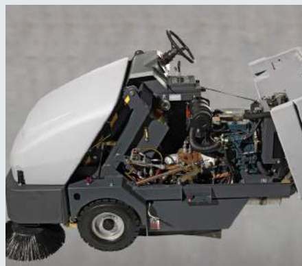
All major components are accessible quickly without the need for tools. Maintenance is fast and simple