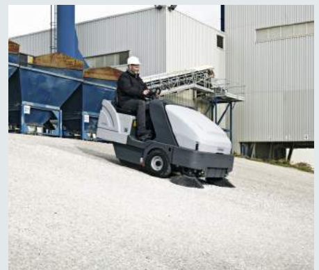
Ramp climbing ability - up to 25%