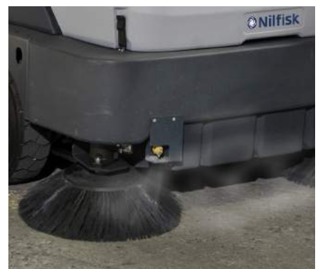
The exclusive DustGuard™ system effectively controls airborne dust by providing a fine mist of moisture to the front and side brushes