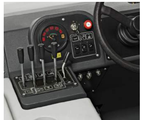
Easy to use operating controls mean more efficient cleaning