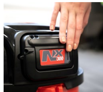
Easy Battery Change