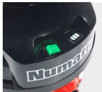
Battery Level Indicator