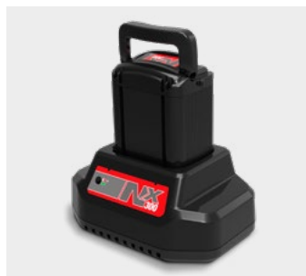
Off-board Charging Unit