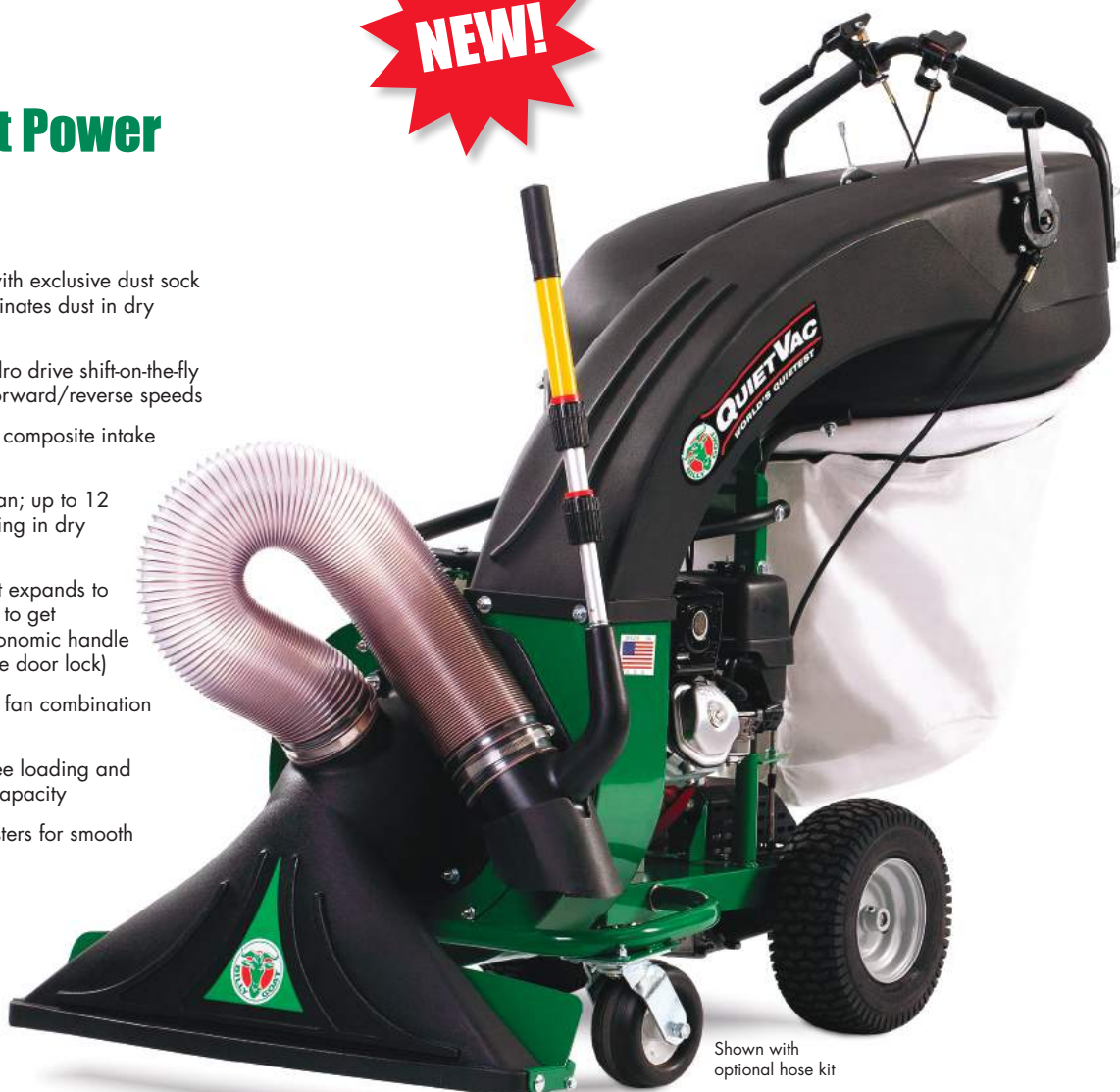
Shown with optional hose kit