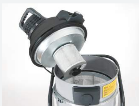
Star filter and absolute filter