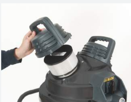
Absolute filtration for the cooling air