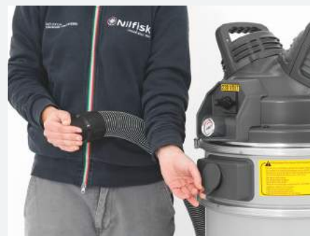
PullClean filter cleaning system: close the inlet and pull the flap rapidly and several times