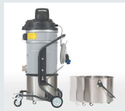
Practical container release system