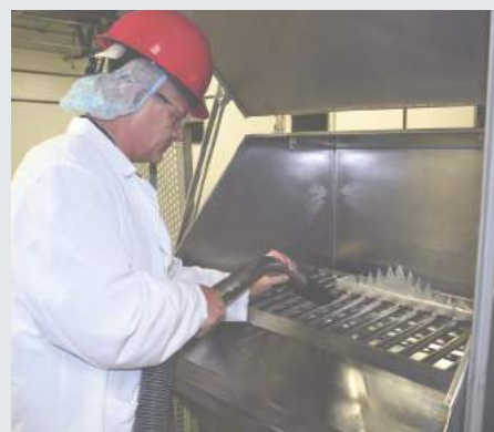
Ideal to clean the processing machine at the end of the working cycle