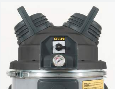
Vacuometer to monitor constantly the vacuum cleaner performances