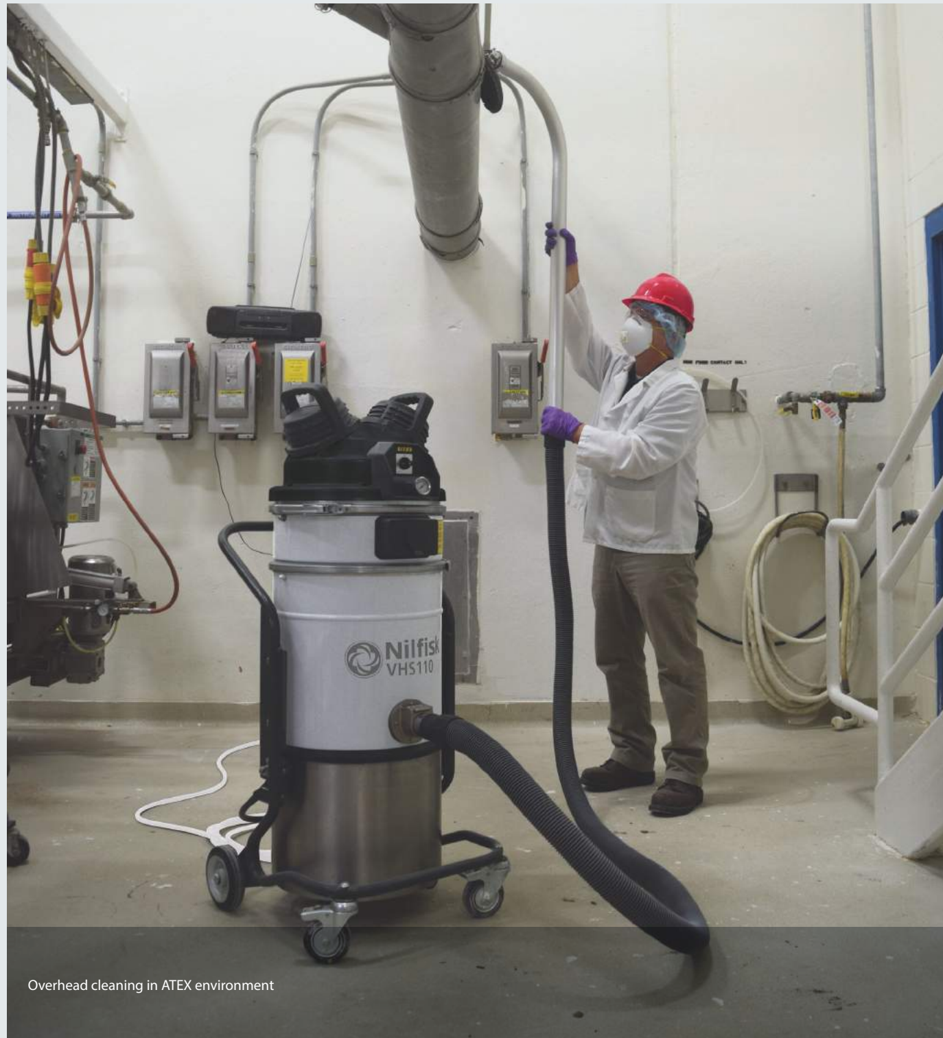
Overhead cleaning in ATEX environment

Filtration is another top-feature: the standard model is equipped with a L-class antistatic star filter with a 1 m 2 area. Absolute filters HEPA14/ULPA15 for the safe collection of toxic dust are available as optional. The innovative PullClean system allows fast and efficient filter cleaning while the machine is running.