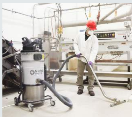
Cleaning of the production area to secure the highest level of hygiene