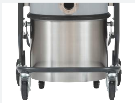
Stainless steel 37L container