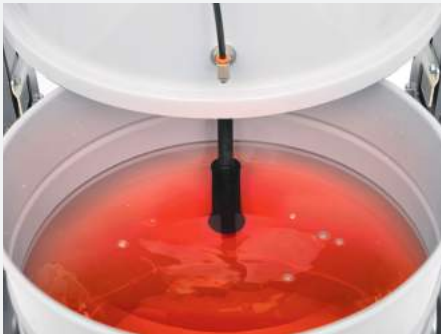
Liquid cut-off system