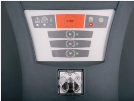
Electronic board control