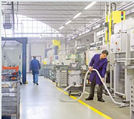
Cleaning of a metal company