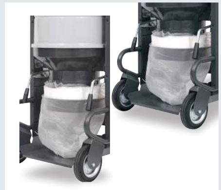
S3 with gravity unload system with Longopac®