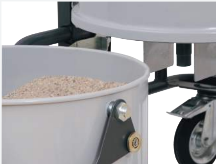
Solid cut-off system