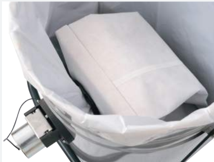
Safe bag for toxic material