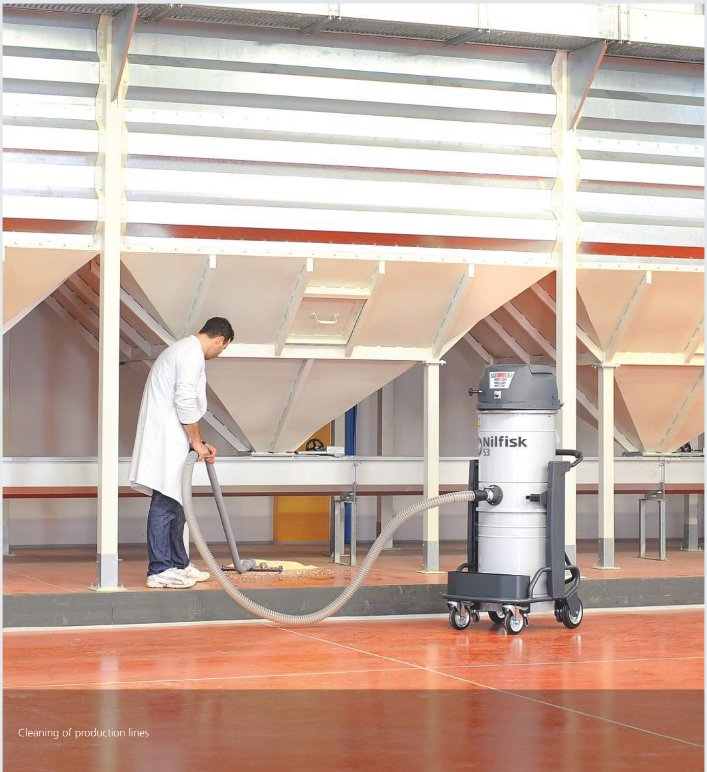
Cleaning of production lines