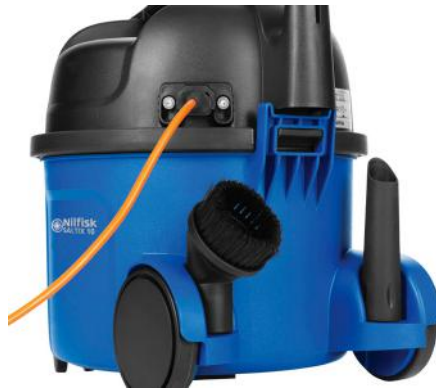
Storage for nozzles allow all the tools you need to be within easy reach at all times