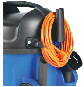
Detachable orange cord and cord hook for controlled storage