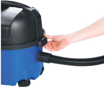
The robust latch system makes it easy to open for changing the dust bag