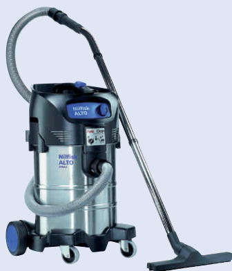
ATTIX 40-01 PC INOX shown

All NEW ATTIX vacuums include a PET filter which can be washed and is very hard wearing. To improve wet dirt collection the NEW range also features a 'fleece' filter bag. This NEW bag is more durable to wet dirt which means easier disposal.