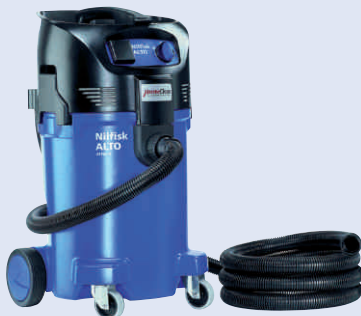
ATTIX 50-21 XC shown