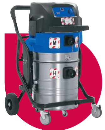
ATTIX 965-0H/M SD XC

All H-class machines are supplied with a filter individually tested and certified. Depending on your cleaning requirements you can choose from various product characteristics such as different container sizes, soft start, manual filter cleaning and much more.