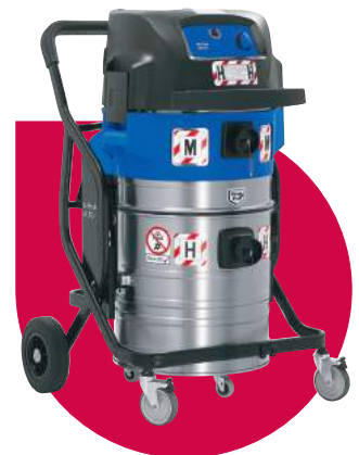
ATTIX 995-0H/M SD XC TYPE 22

Nilfisk-ALTO offers a range of safety vacuum cleaners to pick up explosive dust and separate it from the surrounding air. If dusts are to be vacuumed which are both explosive and hazardous, these vacuums can meet the requirements for both.