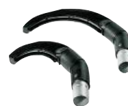
Pipe cleaning nozzles For external cleaning of pipes with a diameter 70-120 mm and tubes with a Ø 120-200 mm