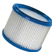
Filter Element Filter element with high filtration efficiency ensures a pleasant air.