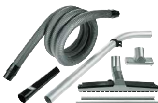
Industry Set 6 parts Ø 50 mm inc: Suction hose 4 m, curved 1m anodized aluminum extension tube, Industrial floor nozzle - aluminum, Replacement rubber lips, Special plastic crevice nozzle, Coarse dirt nozzle - aluminum