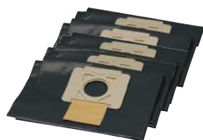
Disposal bag VPE 5 piece

Our accessories for safety vacuum cleaners comply with the standards and regulations. For ATEX Zone 22 applications "conductive" special accessories must be used.