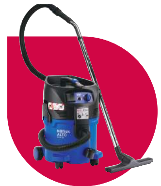
ATTIX 30-2M PC

Reduce cost with the washable PET Fleece filter element eliminating unwanted cleaning interruptions of work and to ensure consistently high suction performance and low maintenance costs.