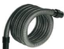
Suction hose - Ø 36 mm • Antistatic, Ø 32 mm, 5 m, with tool adapter