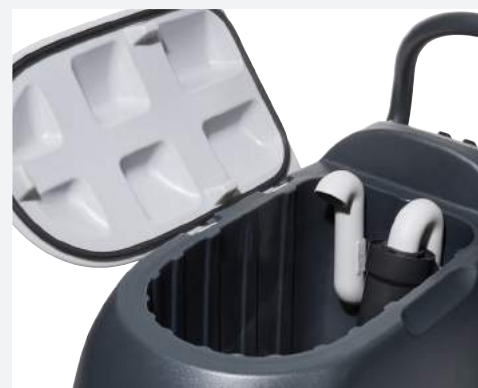
Large recovery tank and removable lid make it easy for you to clean and maintain the equipment. Fast and hygienic.

Specifications and details are subject to change without prior notice.