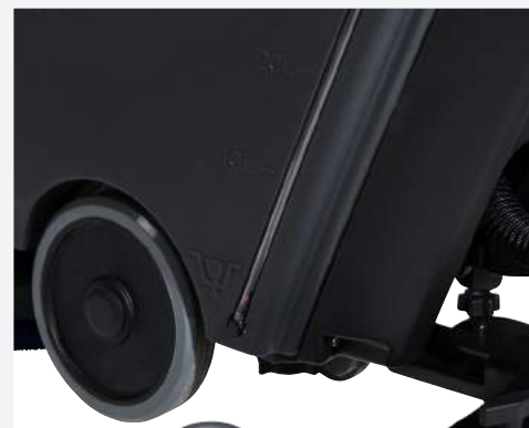
Built-in water level indicator.