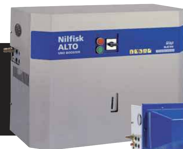
Nilfisk-ALTO UNO BOOSTER