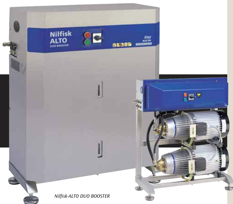
Nilfisk-ALTO DUO BOOSTER