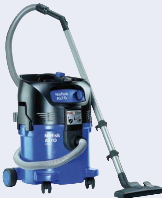
ATTIX 30-01 PC shown

ATTIX 30 models are available in both 110v, 230v and battery power. This is the first battery driven wet & dry vacuum cleaner on the market. The Li-Ion battery technology provides 30 minutes of run time meaning there is no need to be concerned about trailing cables or connection to a power socket. (BATTERY version available Spring 09)